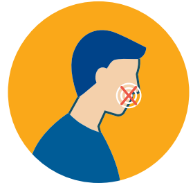
NEW LOSS OF TASTE OR SMELL