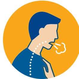
VOMITING OR DIARRHEA