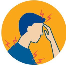
HEADACHE/ MUSCLE OR BODY ACHES